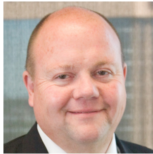
Kevin Fenwick, Q.C., Deputy Minister of Justice and Deputy Attorney General, Government of Saskatchewan